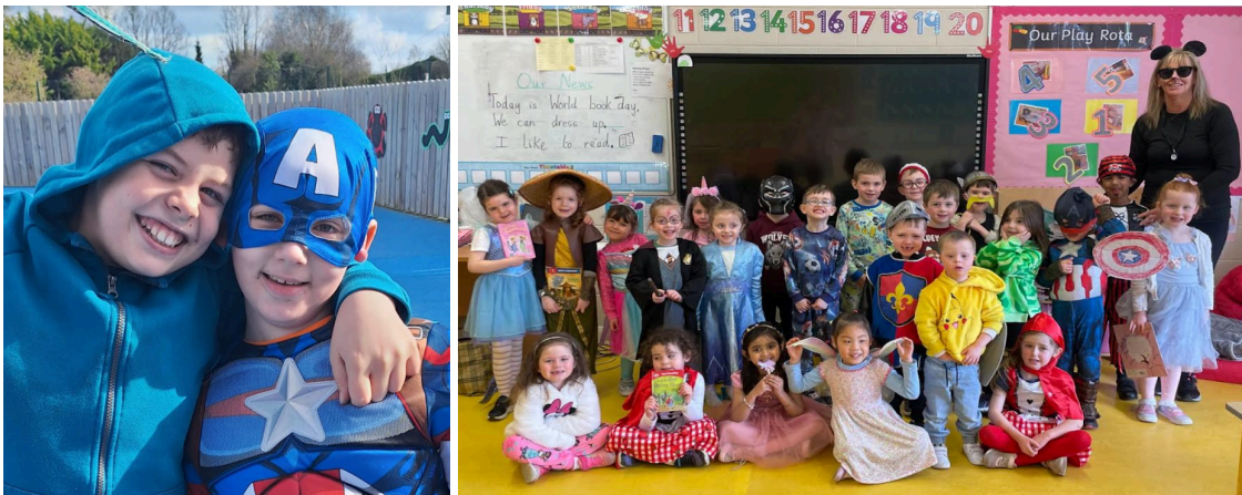
The children and staff enjoyed our Dress Up as Your Favourite Character Day!

We are very grateful to all parents, guardians and staff for your support in making our Book Fair a successful one! As a result of your generosity, we now have raised the above amount to spend on books for our libraries. Míle buíochas!