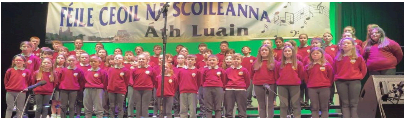
The children in 4th and 5th classes who performed at Féile Ceoil Na Scoileanna last week