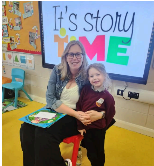
"My Favourite Story Project"