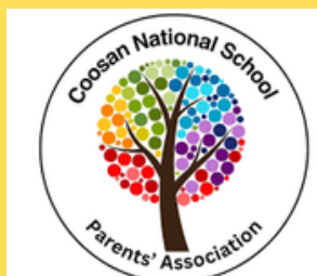
Table Quiz & Raffle Thursday June 4 th @8pm

Entry for each team of 4 is 40 euro per table. Our Monster Raffle! is 5 euro per entry. Raffle envelopes will be on the tables on the night. Doors open at 7pm with the quiz starting at 8pm sharp.